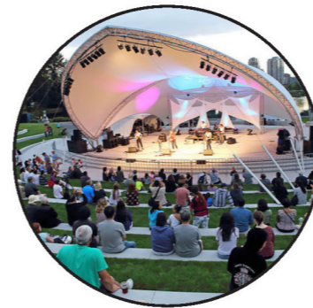
Performance & Arts