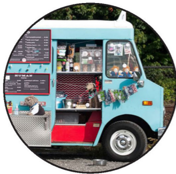
Food & Beverage