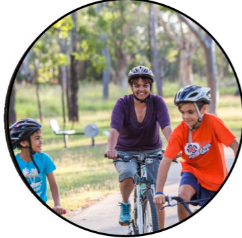
Cycle & Mountain Bike