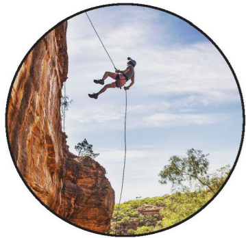
Climbing & Abseiling