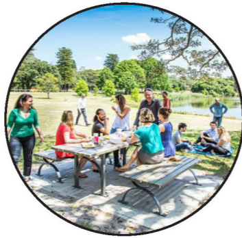
BBQ & Picnic